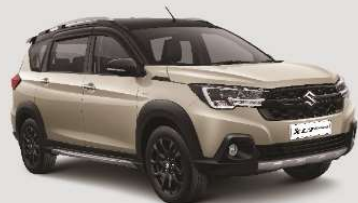
NEW SAVANNA IVORY 2 - BLACK