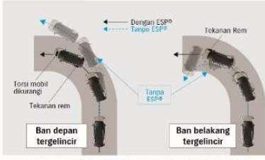
ESP®*** (ELECTRONIC STABILITY PROGRAMME)**