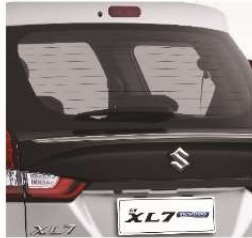
REAR WINDOW DEMISTER**