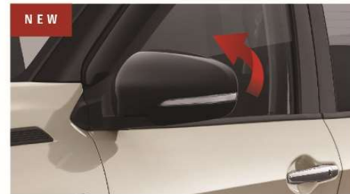
AUTO RETRACTABLE MIRROR**