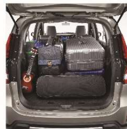
EXTRA SPACIOUS LUGGAGE