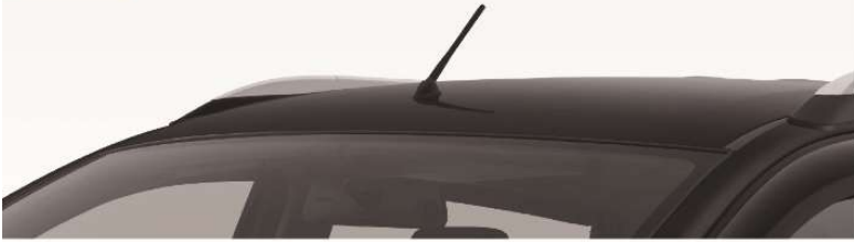
SHORT POLE ANTENNA