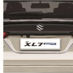
BOLD NUMBER PLATE GARNISH CHROME*