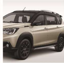
DUAL TONE COLOR*