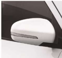
ELECTRIC FOLDABLE** & ADJUSTABLE OUTSIDE DOOR MIRROR