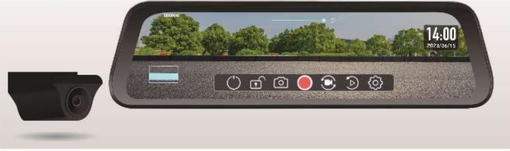
E-MIRROR TOUCH SCREEN*