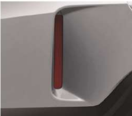
STUNNING REAR BUMPER REFLECTOR

Memiliki semua fitur Zeta, dilengkapi fitur terkini yang akan membuat pengalaman berkendara lebih menyenangkan.