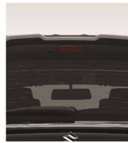
STUNNING REAR UPPER SPOILER*