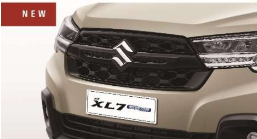
BLACK FRONT GRILL DESIGN**