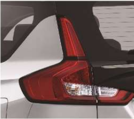
BOLD LED REAR COMBINATION LAMP WITH LIGHT GUIDES**