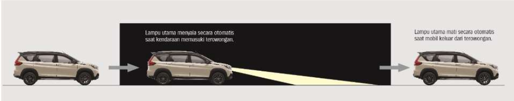
AUTOLIGHT WITH GUIDE ME LIGHT**

Buat pengalaman berkendara tetap seru namun nyaman dan aman melalui sistem keamanan terkini yang tersedia pada semua varian.