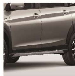
MUSCULAR GARNISH SIDE SILL SPLASH