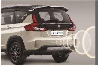
REVERSE PARKING SENSOR