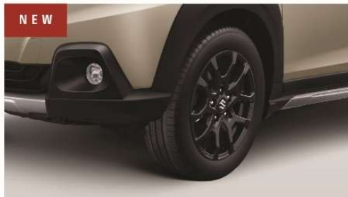
BLACK ALLOY WHEELS**