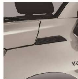
BOLD HOOD SIDE SLIT