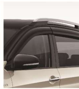
STUNNING DOOR VISOR*