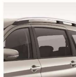
MUSCULAR ROOF RAILS