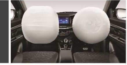
SRS AIRBAG SYSTEM