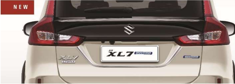
TAILGATE GARNISH CHROME